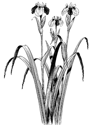
Yellow flag iris Iris pseudacorus

Nationally, the number of Britain's ponds has been steadily declining this century. Swan and Oldham (1989) estimated that pond loss since the Second World War was of the order of 38%. Analysis of Countryside Survey 1990 results for the Department of the Environment suggested similar rates of loss (ca. 1% per annum) in the period 1984 to 1990 (Barr et al. , 1994).