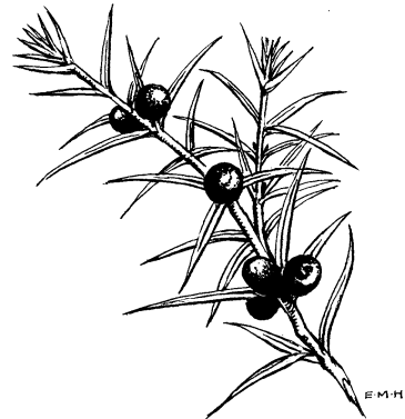
Juniper Juniperus communis