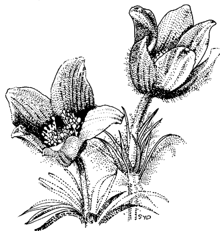
Pasque flower Pulsatilla vulgaris