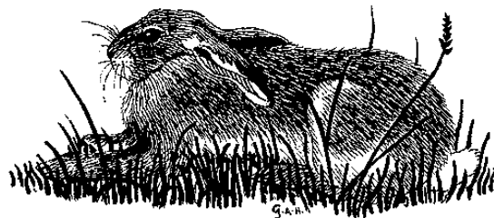
Brown hare Lepus capensis

Farm buildings, tracks, hardstanding and walls can provide an important habitat for a number of specialised plants and animals including barn owls, bats, annual plants, stonecrops, mosses and ferns. Replies to the Oxon Farming Study questionnaire indicated that 54% of farms had redundant buildings and 68% of these were built before 1940. Such buildings generally have more nooks and crannies, which provide access and shelter for wildlife.